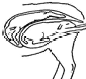
Twins - front and back