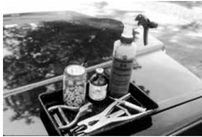
Figure 1. Lamb Processing Kit

towel or straw wisk, tickling the inside of the nostrils with a piece of straw or blowing into the nostrils ( do not allow your lips to come in contact with the wet lamb while doing this ) will often stimulate breathing. There is also a commercial device 1 for this task.