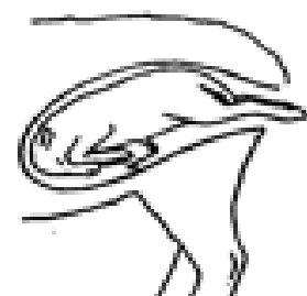
Breech presentation Hind Legs Only