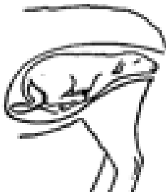
Both forelegs back