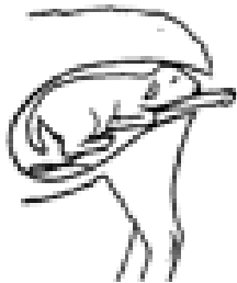
One leg back

In many cases the lamb will be presented normally, you will feel two forelegs with the head between them, in others there will be a malpresentation hindlegs instead of fore legs, or one or both hindlegs back, or a breech presentation, only the tail and rump felt.