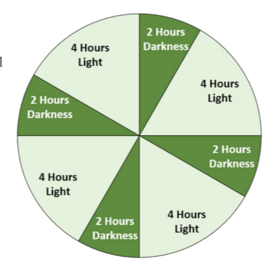
Figure 1.1: Example of an Intermittent Lighting Program

Some chicks continue to rest after arrival from the hatchery, while others seek out food and water. An intermittent lighting program (refer to Figure 1.1) divides the day into resting and activity phases and can assist with synchronising chick activity to improve food and water intake as weaker chicks are stimulated by stronger ones to eat and drink (6). Synchronizing activity has been shown to promote better rest, and can reduce the development of