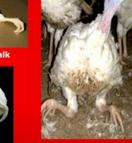
Unable to rise/walk due to