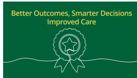
Diversity Leads to Better Decisions