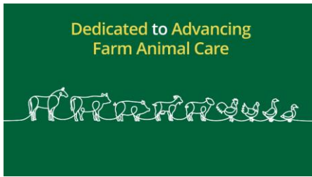
The Importance of NFACC